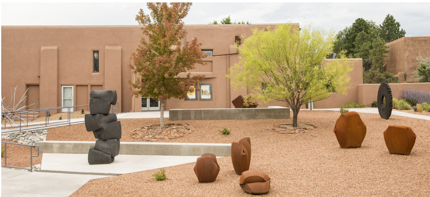
CCA Campus